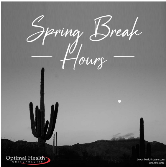
Spring Break is Approaching