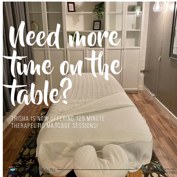
Massage News & Updates